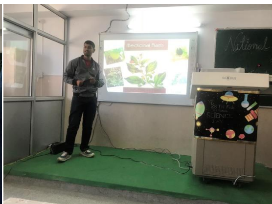
Fig.6 National Science Day