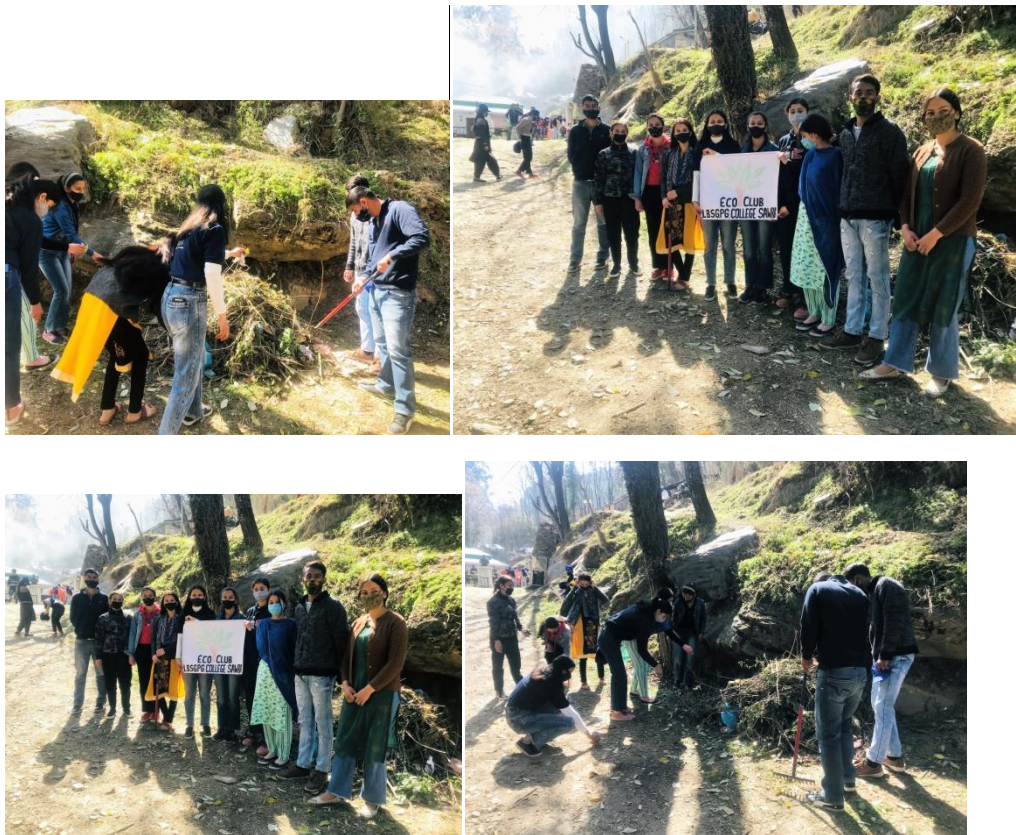
Fig. 1 Cleanliness Drive

Eco Club unit of the college takes this initiative of cleanliness every year to spread awareness among the students and teachers even the surrounding people to think, initiate and implement this. It should be our duty to take one step ahead against the Swachhta Abhiyan and make our region, our state, our country a disease free, pollution free and completely developed country. With this campaign, this year also the members of Eco Club took a pledge to clean our college campus and surrounding areas. We started at 10:30 am with the teachers and students from NSS & NCC. We took brooms and garbage bags in our hands to clean and pick up the plastics found in the campus and surrounding areas. We cleaned every nook and corner of the college including corridors, ground, parking area, canteen area etc. After doing the same for about four hours, we all gathered in the college hall. The refreshment was distributed among the students and the teachers. Eco Club members and some of the students volunteered to give speech on cleanliness campaign and harmful effects of plastics. Everyone was felt so contented in beautifying their own campus. We all took oath not to use plastics, disposables, and to keep our surroundings clean and also motivate others to do the same. The purpose of this campaign was found fruitful.